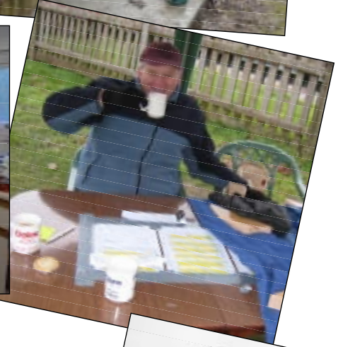
Santa Special 2008